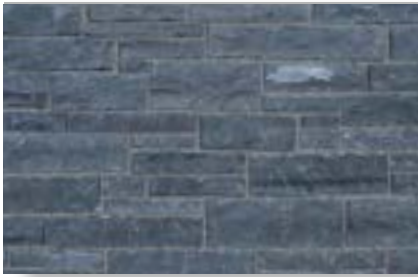
* Black Rundle Limestone