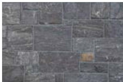
* WestCoast® Quartzite