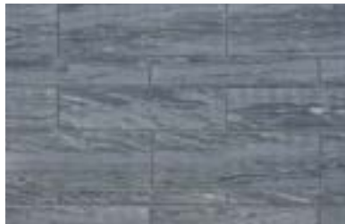
WestCoast® Textured Quartzite