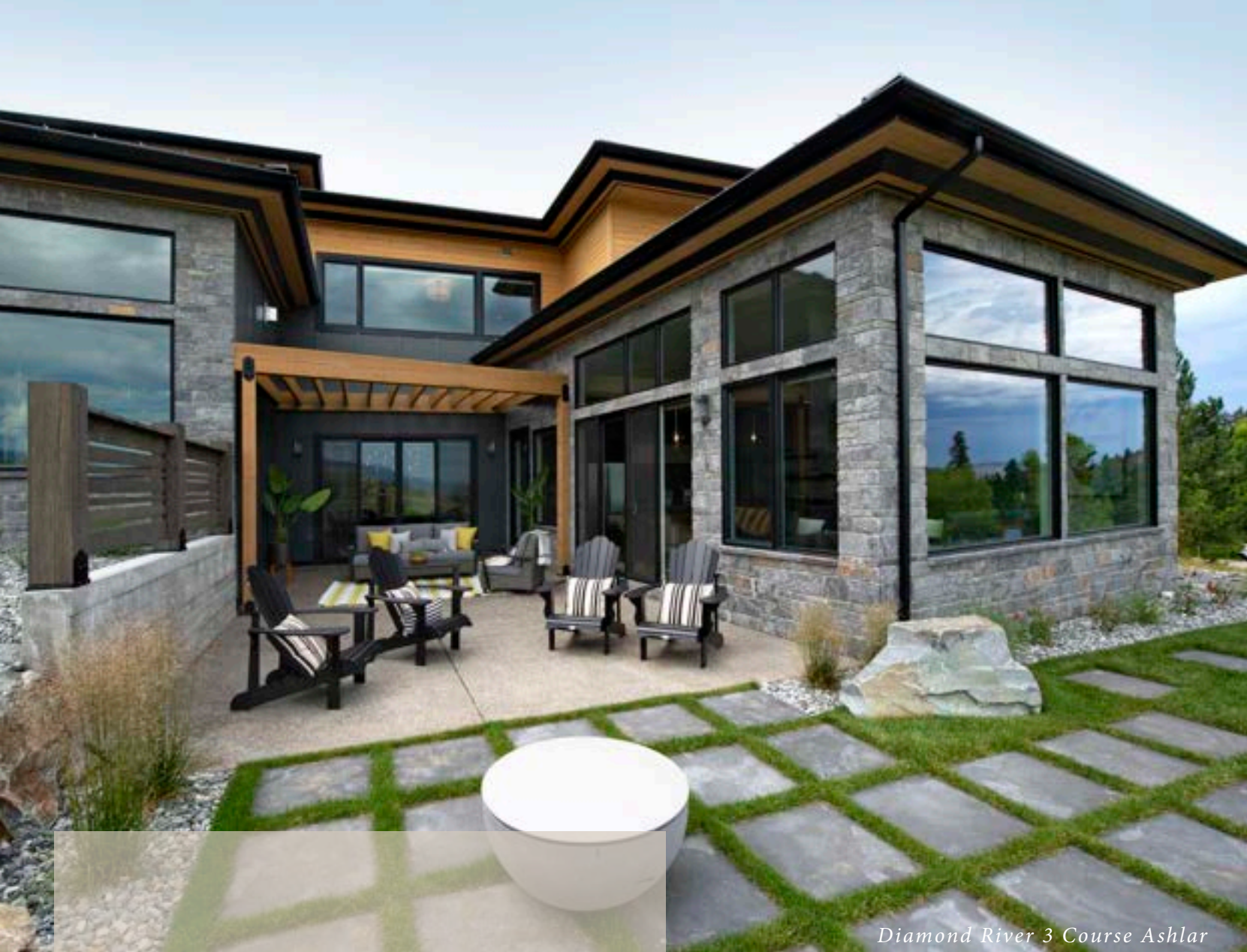
Diamond River 3 Course Ashlar