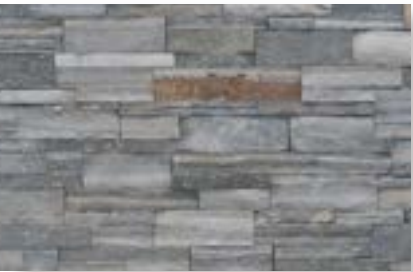
New England Schist