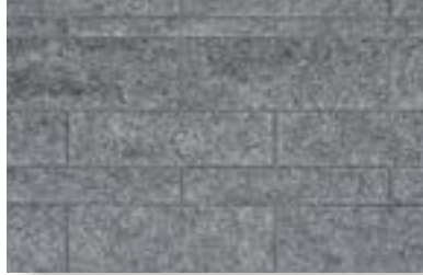
Broadway Split Face Granite