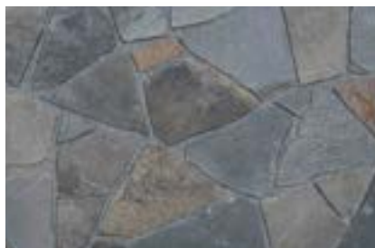
Sierra Ridge Schist