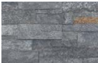
Diamond River Quartzite