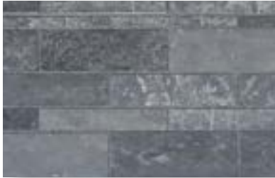
Black Rundle Split Face Limestone