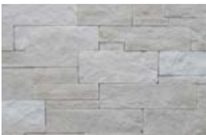
Kings Point Sandstone