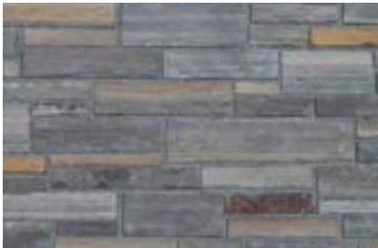
* Copper Canyon Sandstone