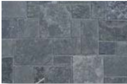
* Black Rundle Limestone