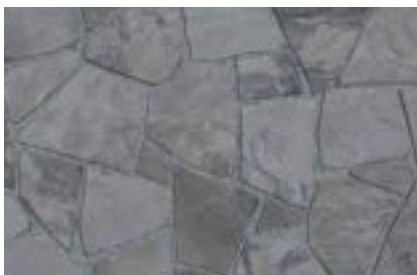
* Grigio Sandstone