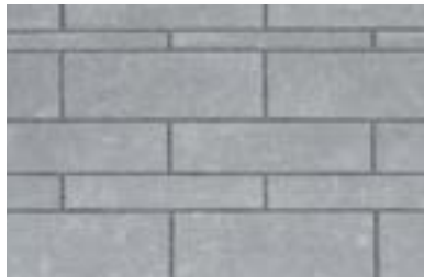
Cambrian Textured Sandstone