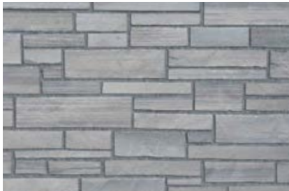
* Grigio Sandstone