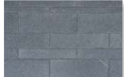
Broadway Textured Granite