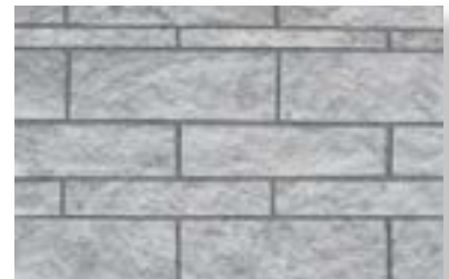
Yukon Split Face Marble