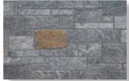
Diamond River Quartzite