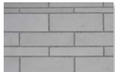
Kings Point Textured Sandstone