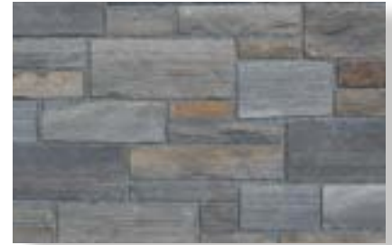
Copper Canyon Sandstone