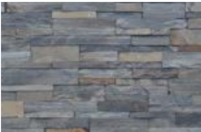
Copper Canyon Sandstone