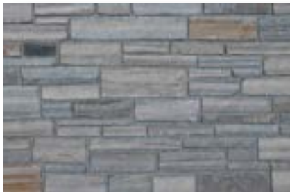
* New England Schist