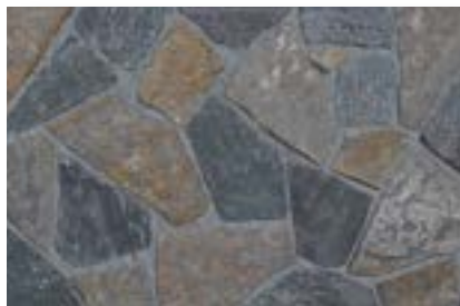
* Lancaster Quartzite