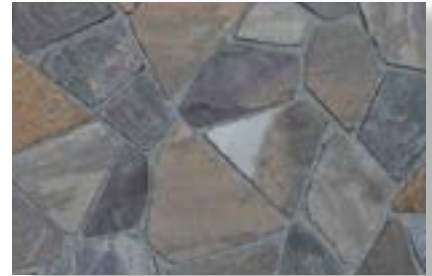
* Copper Canyon Sandstone