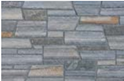
New England Schist