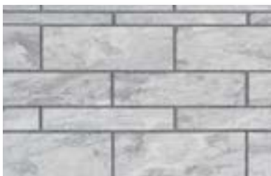
Yukon Textured Marble

GripSet® Technology Installation Ready™ Sawn Cut 4 Sides