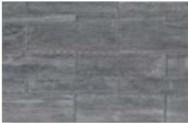
Cambrian Split Face Sandstone