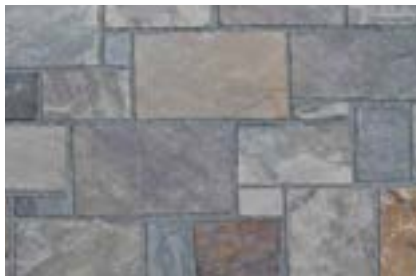
* Copper Canyon Sandstone