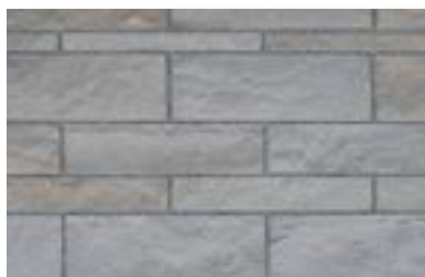
Kings Point Split Face Sandstone