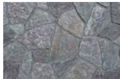
* WestCoast® Quartzite