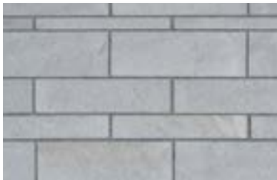
Chinook Textured Granite