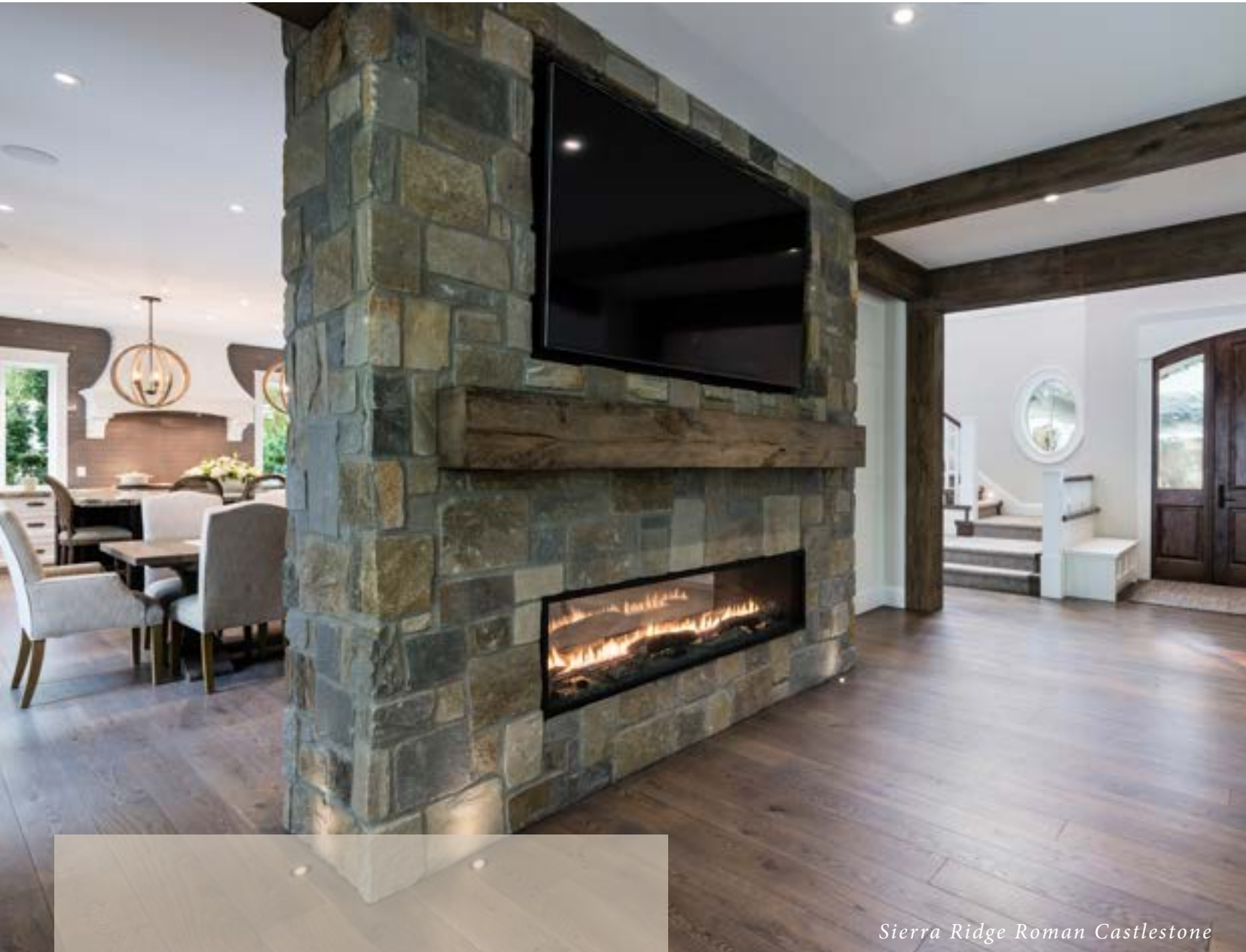
Sierra Ridge Roman Castlestone