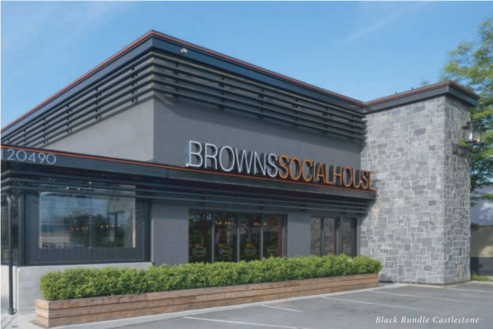
Black Rundle Castlestone