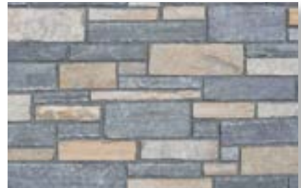
* Lancaster Quartzite