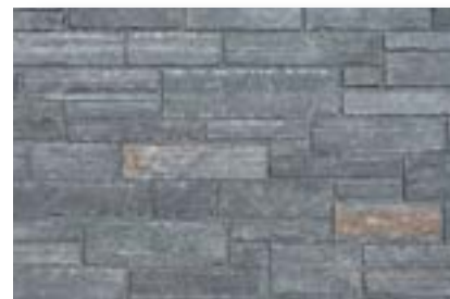
* WestCoast® Quartzite