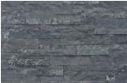
Black Rundle Limestone