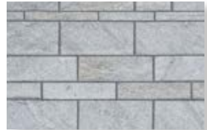
Chinook Split Face Granite