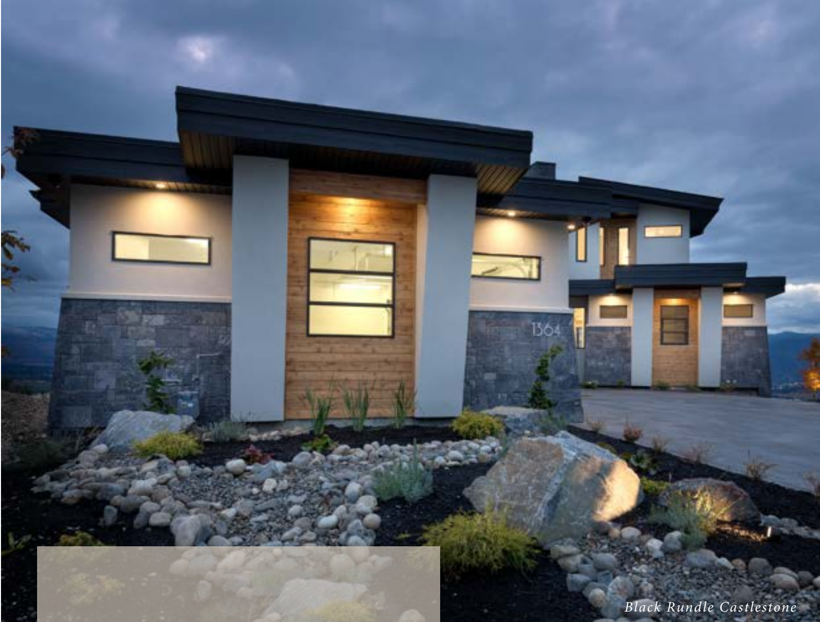
Black Rundle Castlestone