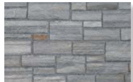
New England Schist