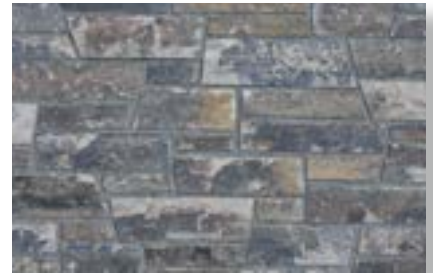
Thunder Ridge Sandstone