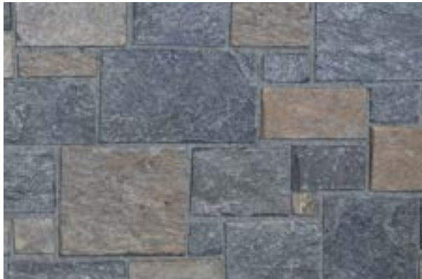
* Lancaster Quartzite