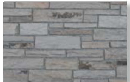
* Tuscan Sandstone