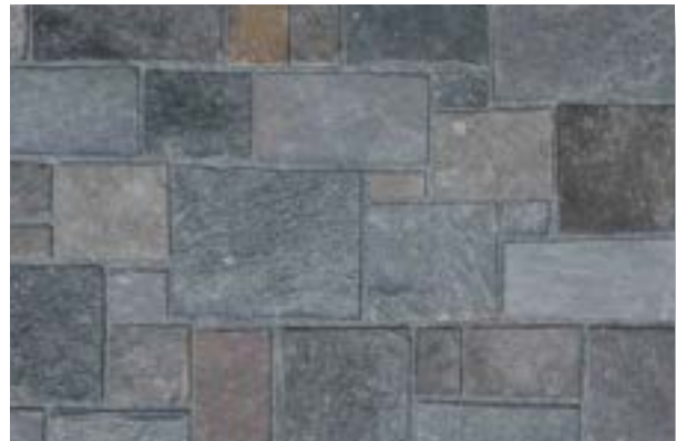
Sierra Ridge Schist