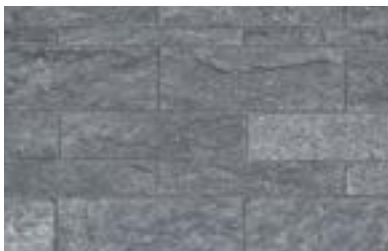
WestCoast® Split Face Quartzite